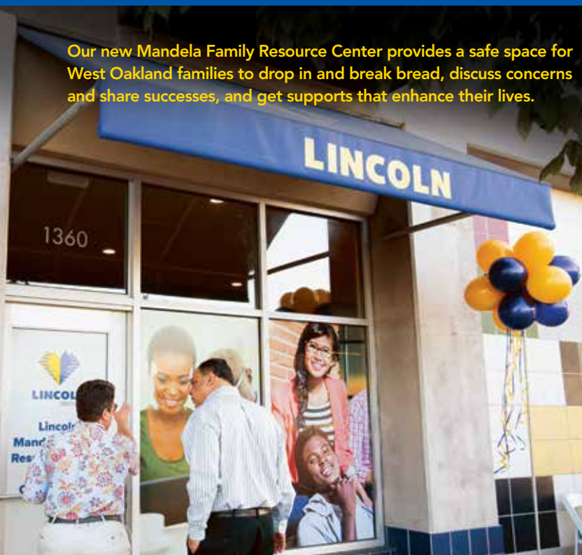
Our new Mandela Family Resource Center provides a safe space for West Oakland families to drop in and break bread, discuss concerns and share successes, and get supports that enhance their lives.

We're excited for what's ahead and look forward to providing even more youth and families opportunities for realizing a positive, productive, and equitable future.